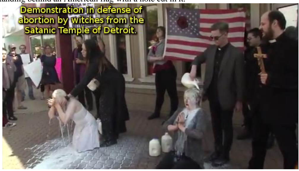
(See "Protesters show up in masses against Planned Parenthood" Fox 2 News, Detroit, Michigan, Aug 22, 2015, retrieved Aug 9, 2017, [fox2detroit.com/news/local-news/10793008-story])

It's not uncommon to see witches, pagans, and Satanists defending abortions and abortion clinics during protests. For example, in 2015, many Michigan protesters showed up to speak out against Planned Parenthood (one of the most antiparental, anti-life organizations on the planet), and they were met in opposition by witches from the Satanic Temple of Detroit, dressed in all black, and put on a show by pouring gallons of milk on women kneeling and hands bound on the side walk, while standing behind an American flag with a hole cut in it.