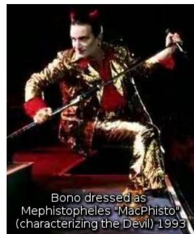
Bono dressed as Mephistopheles "MacPhisto" (characterizing the Devil) 1993

-Paul "Bono" Hewson, Mother Jones Magazine , Vol. 14, No. 4, p. 35, ISSN: 0362-8841