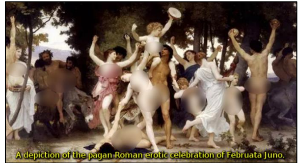
A depiction of the pagan Roman erotic celebration of Februata Juno.