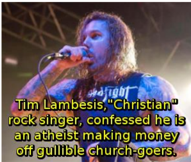
Tim Lambesis, "Christian" rock singer, confessed he is an atheist making money off gullible church-goers.

If a born-again Christian, who has some time and experience under his belt, were to participate in the revelings of the world, blasting loud music as many of them do, being loud and boisterous, they could easily wound the weak conscience of those around them, thereby leading others, and especially new Christians, to believe that such things are acceptable to God. When we wound the weak conscience of others around us, we sin against Christ.