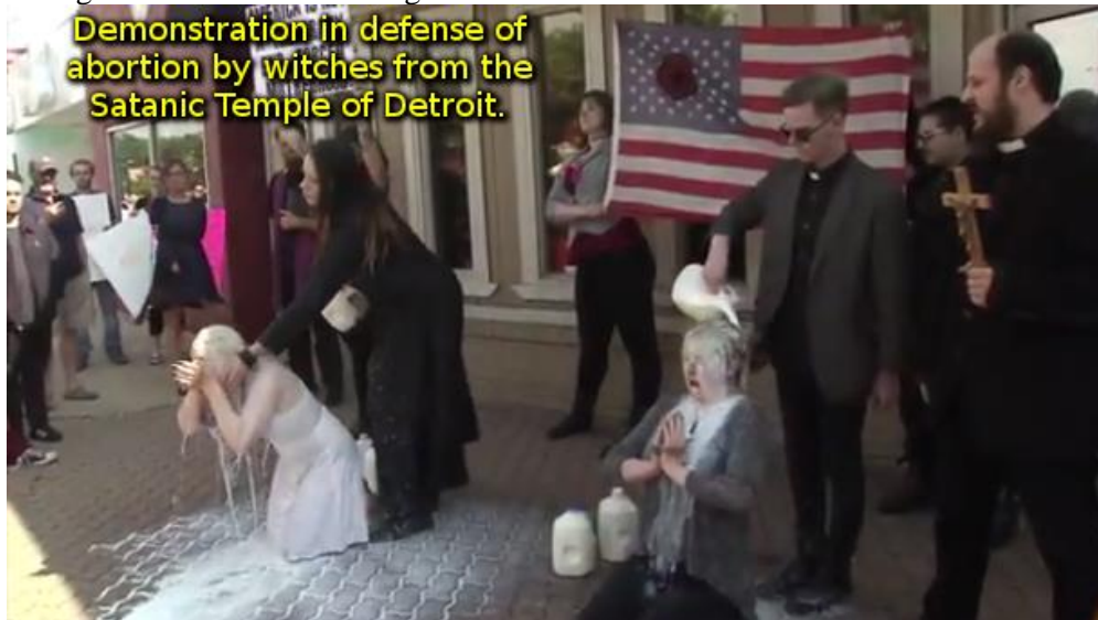
Demonstration in defense of abortion by witches from the Satanic Temple of Detroit.

It's not uncommon to see witches, pagans, and Satanists defending abortions and abortion clinics during protests. For example, in 2015, many Michigan protesters showed up to speak out against Planned Parenthood (one of the most anti-parental, anti-life organizations on the planet), and they were met in opposition by witches from the Satanic Temple of Detroit, dressed in all black, and put on a show by pouring gallons of milk on women kneeling and hands bound on the side walk, while standing behind an American flag with a hole cut in it.