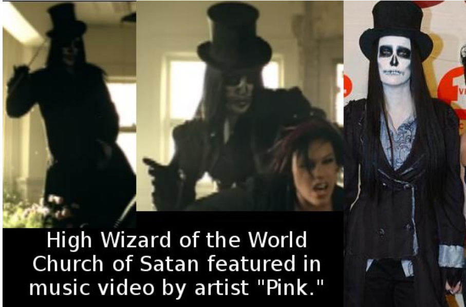
High Wizard of the World Church of Satan featured in music video by artist "Pink."

"I had done magick from the age of 10 and became a High Wizard when I was about 21 years old. I had been in the World Church of Satan for about 3 years. I had seen a High Wizard back when I was a child, but I didn't know that that is what I was looking at. The look is very unique. It's a top-hat, a wand or a cane, the face painted like a corpse, and an old-school tuxedo of sorts. If you go to YouTube, and look up Pink's Like a Pill, there's a High Wizard that appears in her video four times.